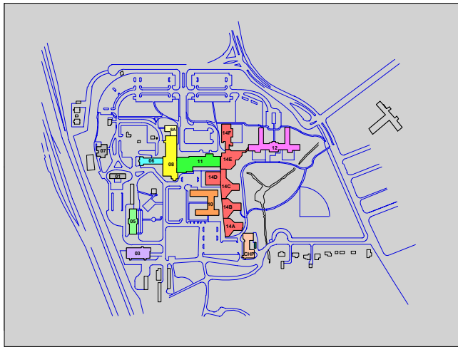
Bergen Pines County Hospital: Site Plan